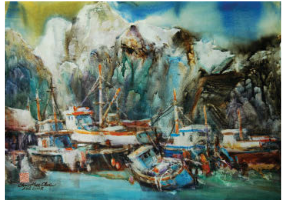
Homer, Alaska, Impression. 22 x 30 inches (2008)

also easy to make changes. I utilize these qualities and take an improvisational approach to paint subjects such as rocks, mountains, and canyons. I start the painting with strong emotion and great speed. I work at white heat for about twenty minutes, trying to cover the entire surface of the board. Gradually, through the act of painting, I discover the subject matter and exert more conscious control to guide the painting to its finishing stage. The painting develops in the very process of painting.